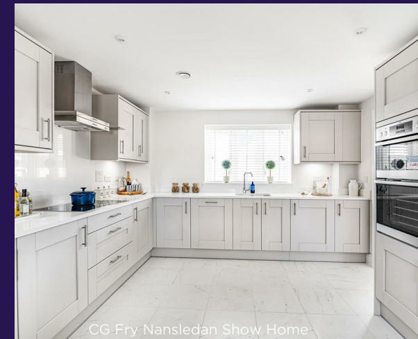
CG Fry Nansledan Show Home